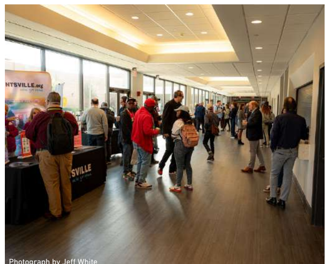
Photograph by Jeff White